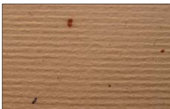
Uncoated paper with a laid finish and added flecks

All of the paper types in this monograph perform beautifully on our offset presses or state-of-the-art digital press. As leaders in the technology of digital imaging, we have the experience