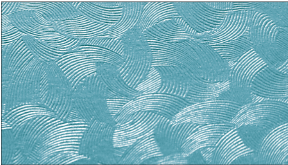
Coated paper with a metallic and embossed finish

These papers lack the coating that fills in the tiny hills and valleys in their surfaces. Therefore, ink tends to spread out and soak in; printed images may appear less sharp and colors less bright. Several different finishing processes produce