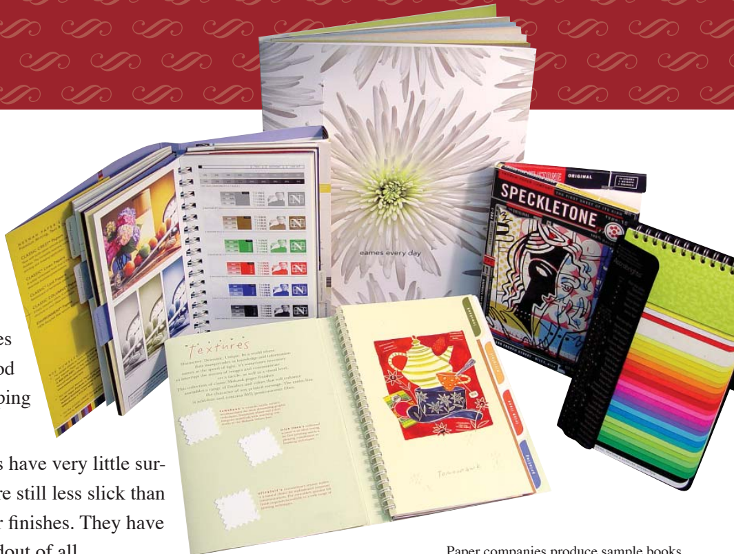
Paper companies produce sample books, sometimes quite elaborate, that showcase their lines of papers.

necessary to take advantage of the many options available with this process. We offer our expertise to you with complete