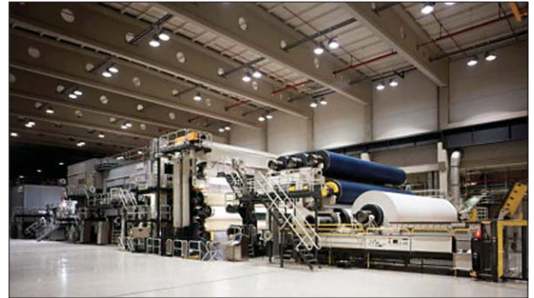
A modern paper-making machine can be as large as 33 feet wide, 66 feet high and the length of two football fields.

Paper is made largely from cellulose fiber, plus additives such as binders, mineral fillers, rosin, and pigments and dyes. The main